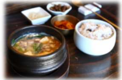
ピニョ食堂 (Korean) Pinyo shokudo 5 min from Sanjo三条 st. 11:30-14, 17:30-21:30 (LO) Close on Thursdays