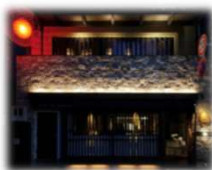
京都五行 Kyoto Gogyo

Tenten-yu and Tenka Ippin soups are what Kyoto people typically love, whereas Iroha, Shinpuku-Saikan, and Murasaki are what I like for its simple soy sauce flavor. TowZen for it's gentle soup, Monsen for it's fusion with sake lees, Gogyo for its burnt soups are great invention.