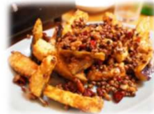
龍門本店 (四川Sichuan Chinese) Ryumon honten 270 m from 地下鉄東山駅 subway Higashiyama st. 17:00 - 5:00 am (7 days)