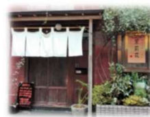
茉莉花(薬膳おばんざい)

Shijo-karasuma 四条烏丸 Kawaramachi 河原町 Kyoto station 京都駅前