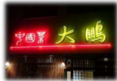
大鵬 Taiho (Chinese) 350 m from JR/地下鉄二条駅 JR/subway Nijo station 11:30 - 14:30, 17:30 - 22:00 Close on Tuesdays