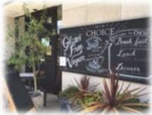
CHOICE (gulten free/vegan) In front of Sanjo station 地下鉄三条駅前 Open 8:30 - 15, 17- 20:30 8:30 - 20:30 (Sat/Sun)