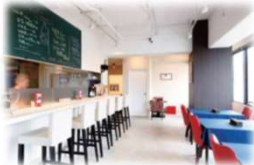
太陽カレー Taiyo Curry 100 m from 阪急西院駅南口 Hankyu Saiin st. South exit 11:00 - 14:30, close on Sun