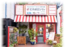
ビカポロンツァ Pikapolonca (Slovenia) 650 m from JR花園駅 Hanazono st. 12-15, 18-21, close on Mon