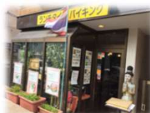
イーサン E-san (Thai) 80 m from 地下鉄今出川駅 subway Imadegawa st. 11-14:30 (15 Sa/Su), 17-22 Close on Tuesdays