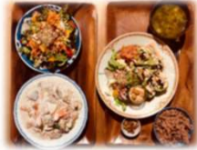
Organic House Salute (vegetarian) 700 m from Kyoto station 11:30-14:30, 17:00-18:45 Close on Wed/Thu