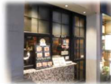
カマル Camal (Indian) 350 m from 烏丸御池駅 subway Karasuma-Oike st. 11:30 - 15:00, 17:00 - 22:30 (7 days)