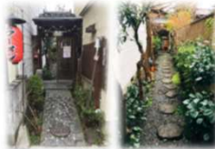
豆乳ラーメン豆禅 TowZen Vegan Soymilk ramen 1.3 km from 一乗寺 Ichijoji st. 11:30 - 14:30, 18:00 - 21:30, Close on Thursdays