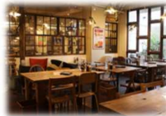
mumokuteki cafe (vegetarian) 550 m from 阪急河原町駅 Hankyu Kawaramachi st. 11:30 - 20:00, close on Wed