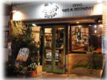
Falafel Garden (cafe w/good view of river) 160 m from 京阪出町柳駅 Keihan Demachiyanagi st. 11:00 - 21:30