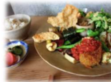
菜食 光兔舎 (vegetarian) Saishoku Kousagisha 400 m from Ginkakuji-michi 銀閣寺道 bus stop 12 - 18, close on Mo/Tu