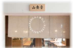
山食音 (vegen) Yamashoku-on 600 m from 京阪出町柳駅 Keihan Demachiyanagi st. 12-15, 18-20:30 CL Tu/We