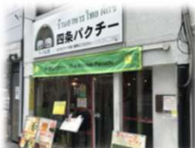
四条パクチー Shijo Pakuchi (Thai) 400 m from 四条烏丸交差点 Shijo-karasuma intersection 11:30 - 15:00, 18:00 - 22:30