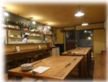
バイタルサイン Baitarusain (vegetarian) 400 mi from 阪急河原町駅 Hankyu Kawaramachi st. Open 18 - 23, close on Tue