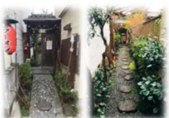
豆乳ラーメン豆禅TowZen (Vegan Soymilk ramen)

Tenka Ippin (HQ) 900 m from 一乗寺 Ichijoji st. 11 - 3 am, close on Thu chicken based, potage like