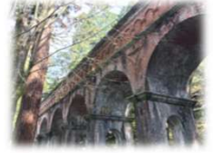
南禅寺 Nanzen-ji temple

100 m from 阪急河原町駅 Hankyu Kawaramachi st. 200 m from 京阪祇園四条駅 Keihan Gion-Shijo st.