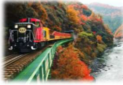
トロッコ列車 Torokko Train

Philosopher's Path 350 m from 銀閣寺 Ginkakuji 650 m from 南禅寺 Nanzenji