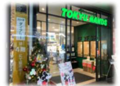
東急ハンズ TOKYU HANDS

50 m from 四条烏丸交差点 Shijo-Karasuma intersection 10:00 - 20:30