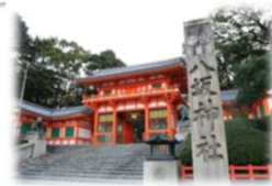
八坂神社 Yasaka shrine

300 m from Kawaramachi st. 阪急河原町駅 OR Keihan Gion-shijo st. 0 min 京阪祇園四条駅前