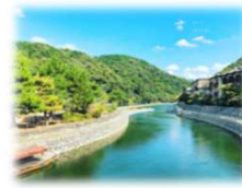
宇治川 Uji-gawa river

1 km from Byodo-in 平等院 (other side of Uji river 宇治川)