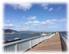
大津市 &amp; 琵琶湖

Suntory Yamasaki Distillery 19 min by Hankyu 阪急 train from Karasuma 烏丸 st. to Ooyamazaki st. 大山崎駅+1km