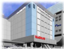
BIC Camera JR京都店

700 m from Kyoto st. Hachijo Exit 京都駅八条口 10:00 - 21:00