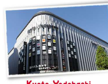
Kyoto-Yodobashi YODOBASHI Camera

Isetan 伊勢丹 10:00 - 20:00 The CUBE 10:00 - 20:00 Porta 10:00 - 21:00