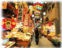
錦市場 Nishiki Market

10 min by subways from Kyoto st. to Keage 蹴上 st. (change at 烏丸御池駅 Karasuma-oike st.) + 850m