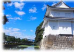
二条城 Nijo-jo castle

11 min by JR from Kyoto to Saga-Arashiyama 嵯峨嵐山 st. 22 min by Randen train 嵐電 from Shijo-omiya 四条大宮 st.