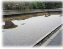
龍安寺 Ryoan-ji temple

From Kyoto st.: 37 min by #101 bus OR 11 min by #101/102/204/205 bus from Kitaoji st. 北大路駅