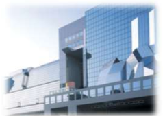
京都駅ビル Kyoto station

Isetan 伊勢丹 10:00 - 20:00 The CUBE 10:00 - 20:00 Porta 10:00 - 21:00